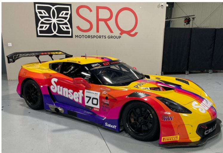
Callaway Corvette C7 GT3-R to Return to GT America Series in 2025