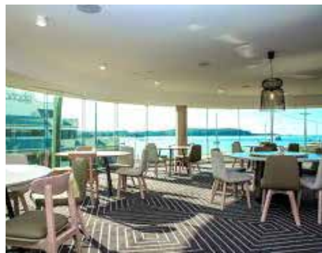
Trip to Cambewarra Mountain Lookout and The Boat fisherman's Club Gerroa for lunch Saturday Night Drinks - Cruise to Mogo and Bateman's Bay