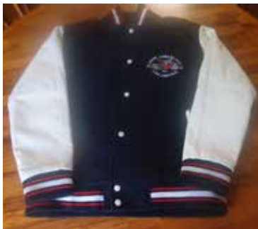
LEATHER SLEEVE JACKETS - $450