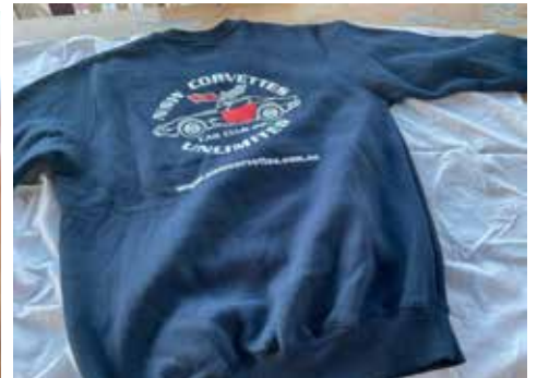
SWEAT SHIRTS - $50