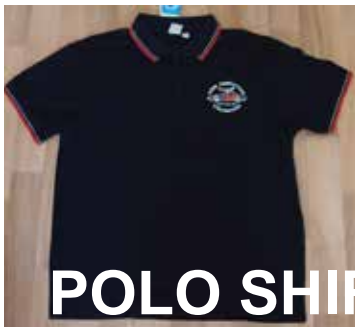
POLO SHIRTS - $40