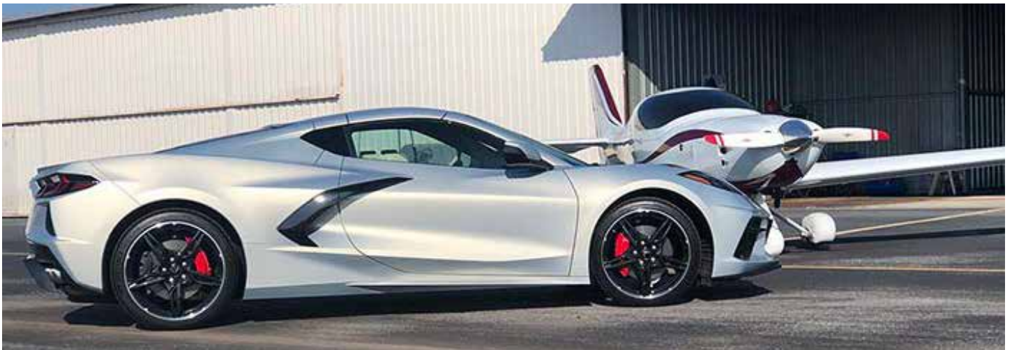
Adam's #007 Silver Flare Corvette

It's been a little while since we have taken to the air around Bowling Green to offer a birds-eye view of the Corvette Assembly Plant.