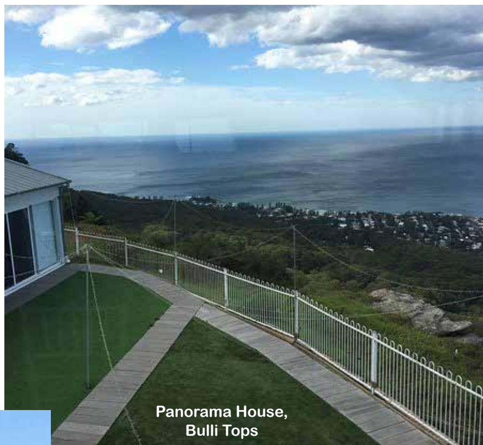
Panorama House, Bulli Tops