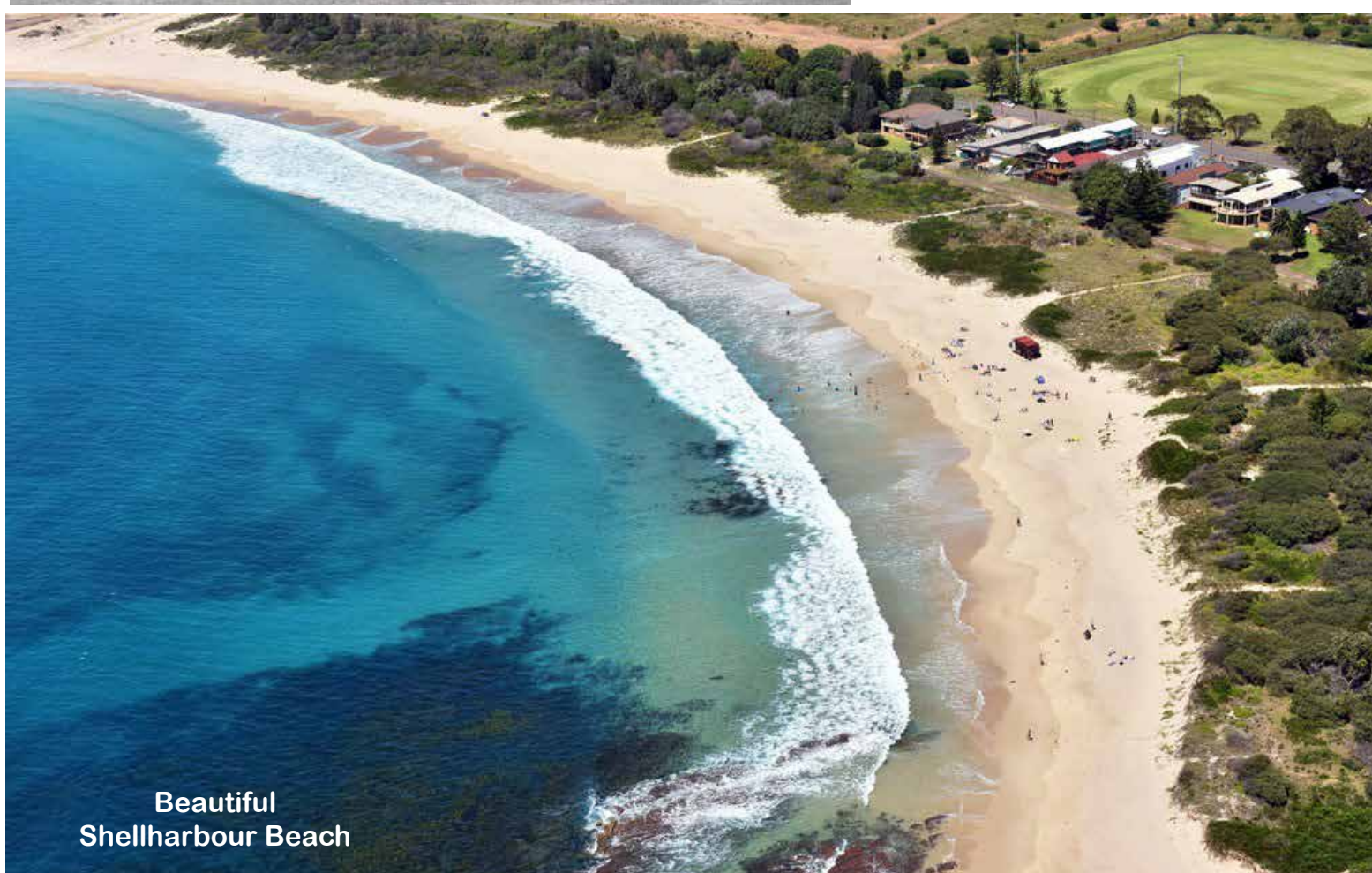
Beautiful Shellharbour Beach