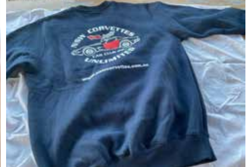
SWEAT SHIRTS - $50