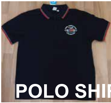
POLO SHIRTS - $40