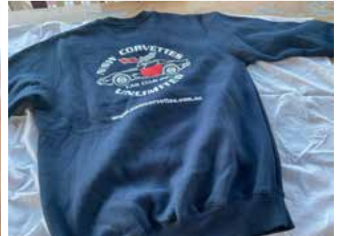
SWEAT SHIRTS - $50