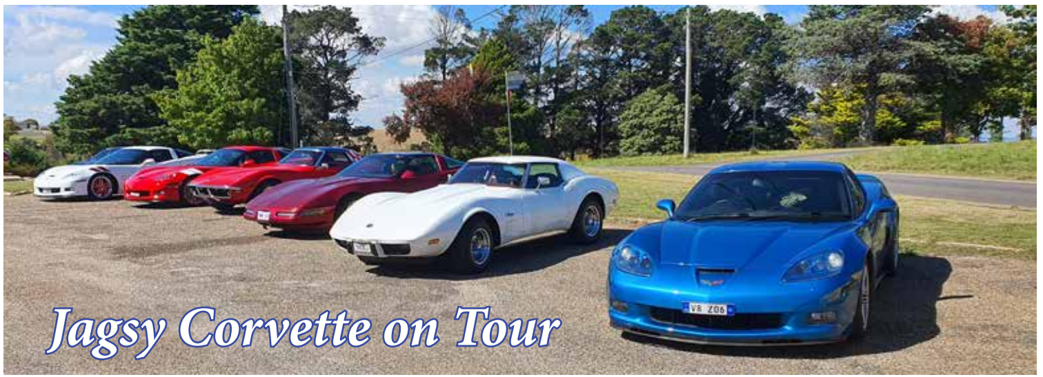
Jagsy Corvette on Tour